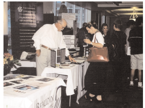
Green-building exhibitors display their products and services in the exhibitor hall adjacent to the conference rooms.