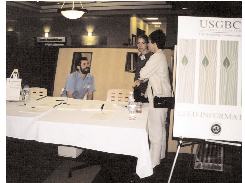
Conference participants were able to purchase the new Colorado Chapter LEED™ Study Guide (see page 5).