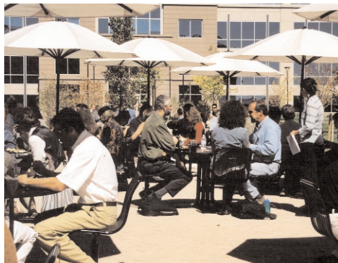
Conference attendees take a lunch break in an outdoor courtyard at the CH2M Hill facility in Englewood.