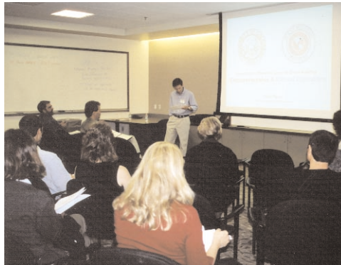
Program sessions introduced attendees to the LEED™ Rating System and other green-building concepts.