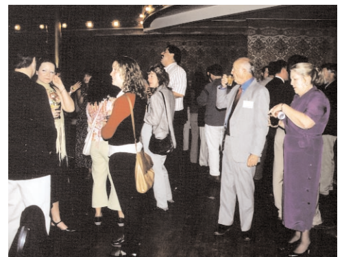
Gala Dinner participants socialize and network at the 1770 Sherman Street Event Complex in Denver.