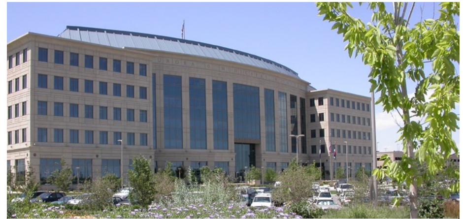
Aurora Municipal Center

By approving the resolution, the Aurora City Council acknowledged its responsibility to promote building practices that protect the city's natural and developed environment. The resolution notes that environmentally responsible building stan-