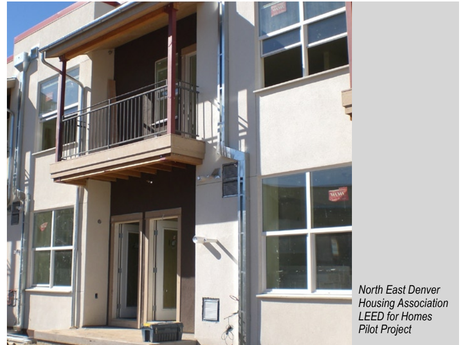
North East Denver Housing Association LEED for Homes Pilot Project

Long before the current foreclosure catastrophe that has battered so many of our residents, Colorado suffered from a dearth of affordable housing. Actually It's reached a crisis point in recent years, due to the dramatic rise in energy costs. According to Energy Outreach Colorado, more than one in five Colorado households qualifies for energy assistance based on federal