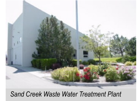
Sand Creek Waste Water Treatment Plant

Environment Aurora has teamed up with Aurora Water to provide support for the Household Chemical Roundup, which provides residents with safe and free disposal of paints and chemicals. Last year, approximately 1,400 gallons of hazardous waste were collected from 1,225 households.